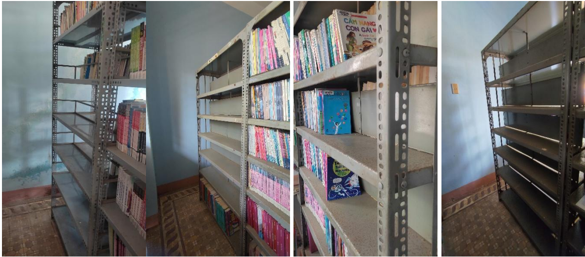
Figure 3: Pictures of Hanh Dung Secondary School and inside its library

Through the Adopt a Book program, A Thousand Hopes delivered 469 brand-new, high quality, age-appropriate books to Hanh Dung Secondary School on 5 June 2026 (with books purchased since Jan/Feb 2026 together with books for the other two schools), covering genres including life skills, science exploration, educational comics, STEM, and English-language materials — directly addressing the school's expressed needs.