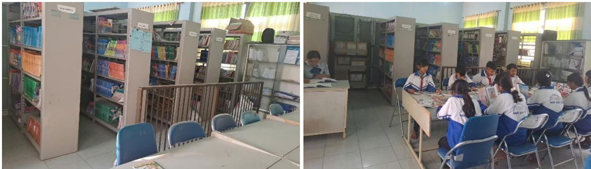
Figure 1: Pictures of Ngo Gia Tu Secondary School and inside its library

Through the Adopt a Book program, A Thousand Hopes delivered 419 brand-new books to Ngo Gia Tu Secondary School on 6 February 2026, purchased from Tre Publishing House, Dinh Ti Books, and Kim Dong Publishing House. The books span a wide range of genres including life skills, Vietnamese history, science and technology, literature, philosophy, STEM, environmental education, and fiction. This donation nearly tripled the school's existing book collection.