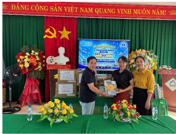
Figure 4: Pictures on handover days for three schools