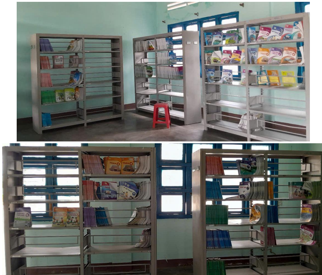
Figure 2: Pictures of Nguyen Tat Thanh Secondary School and inside its library